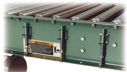
VARIABLE PRESSURE ADJUSTMENT

ELECTRICAL CONTROLS: Magnetic starter (one direction or reversible); One direction manual starter; Momentary start/stop push button station; Forward/reversing /stop push button station. Mounting and pre-wiring for units up to 12' long.