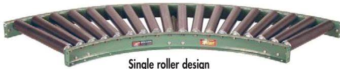
Single roller design