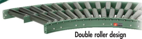
Double roller design